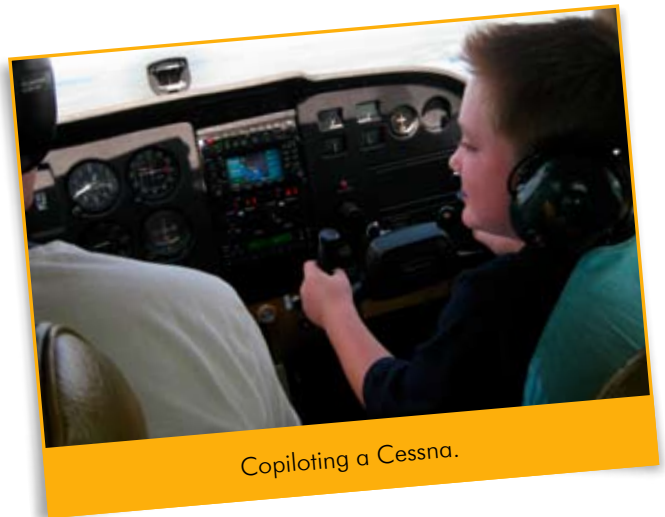
Copiloting a Cessna.

To give online or for more info go to: http://www.spreadtheflame.com/Partner.html