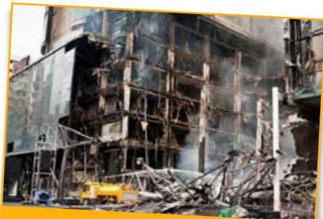
Central World Mall.

under a state of emergency. Eventually everything calmed down and returned to normal.