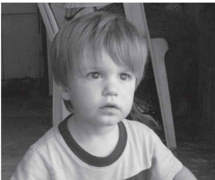
Aslan in wide eyed wonder of it all.