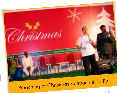
Preaching at Christmas outreach in India!