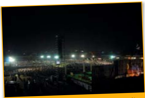
75,000 people at yearly music festival!

At another crusade that drew about 3000 people, I was in the middle of the climax of my presentation of the Gospel when the power shut off to everything and darkened the field and stage. This actually turned to our favor as everyone stayed still in rapt attention as the Christians present began to sing worship and others worked to get the power back on. When it finally came back on, I finished preaching about the power of God over darkness. In the end, God wins!