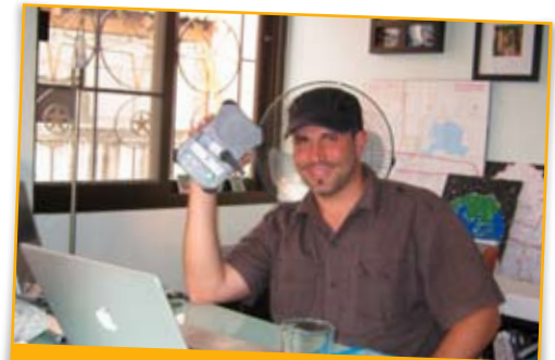
Saber MP3 units loaded with teaching and music.

new Isaan farmers who have become believers, and one to a man who is lying in bed dying of cancer. Their feedback has been