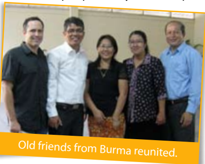
Old friends from Burma reunited.