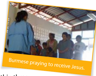
Burmese praying to receive Jesus.